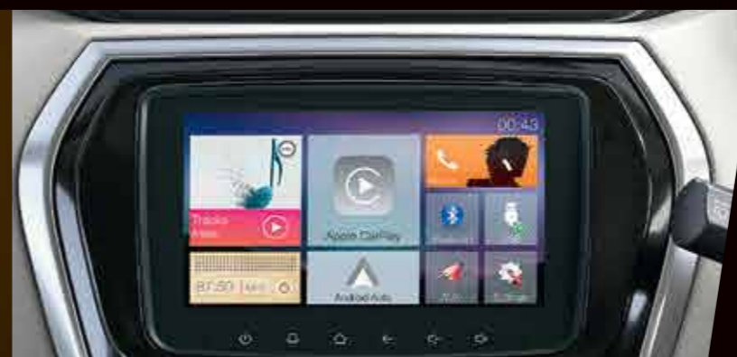
7" Touchscreen with Advanced Infotainment System

Enjoy your favourite music. Navigate your way. And stay connected on the go with the Android Auto and Apple Car Play on the Advanced Infotainment System with 7" capacitive touchscreen.