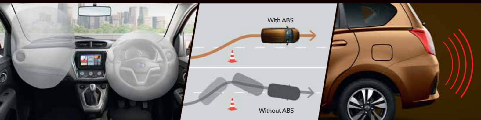
Dual Front Air-Bags

Make every drive a safe drive. The Datsun GO+ is packed with next generation safety features to keep you and your loved ones safe.