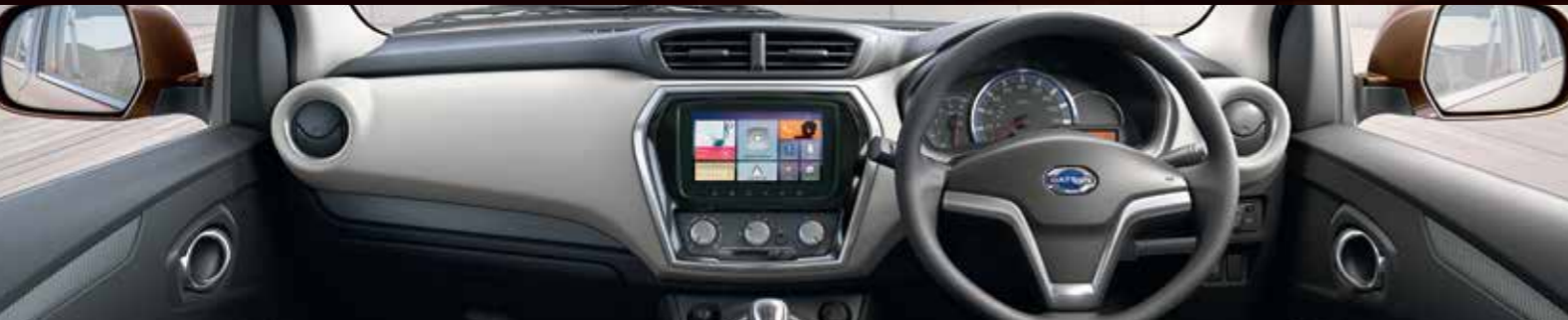
Dual Tone Premium Interiors.

We know what you need in your car. And have designed accordingly.