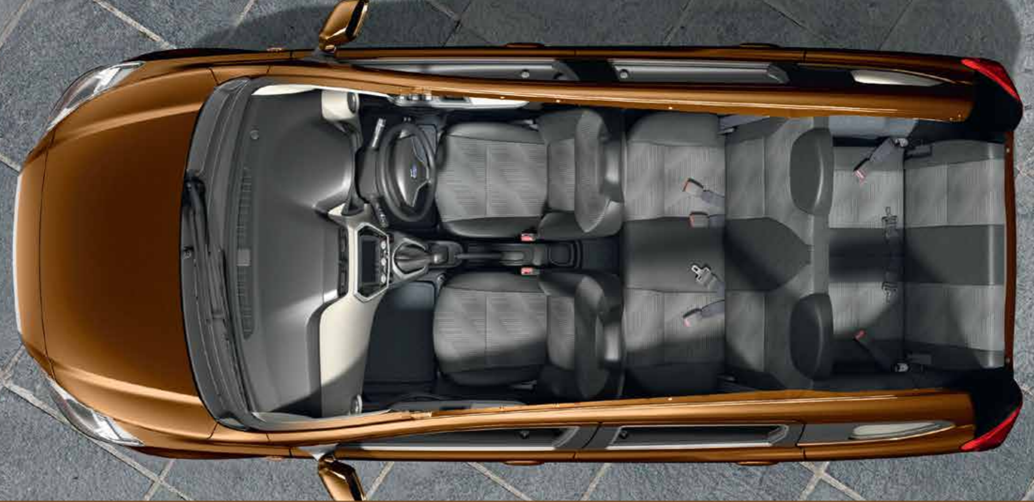
Zero Gravity Inspired 5+2 Seating

There's always more room for a family adventure in the new Datsun GO+ 5+2 seating with Anti-fatigue Seats to maximize comfort while reducing fatigue.