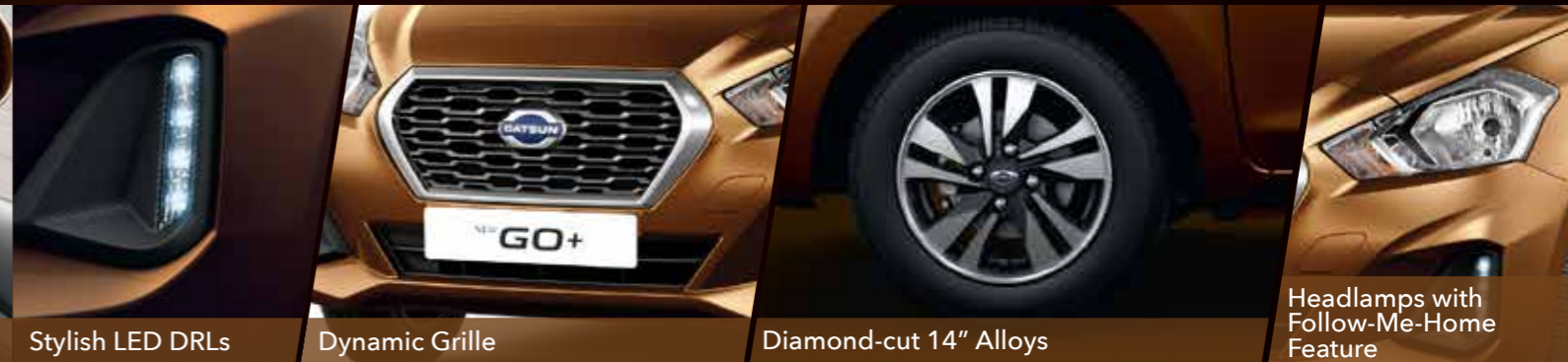
Stylish LED DRLs

Turn heads on the road with a dazzling range of new generation features.